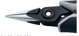
34 52 130 ESD ⚡️ ✳️ ◯ ◻️ ◻️ ◻️ ◻️