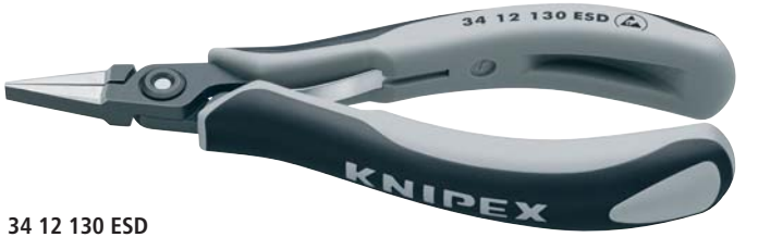
34 12 130 ESD ⚡️ ✳️ ◻️ ◻️ ◻️ ◻️ ◻️